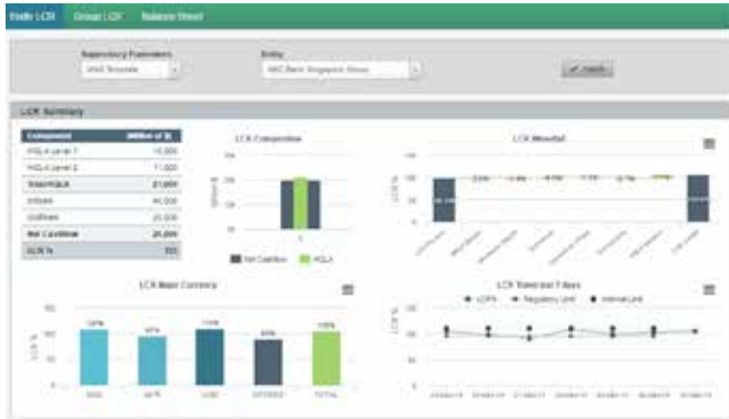
LCR by Entity Pre Built Dashboard