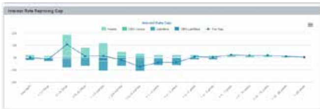
Interest Rate Repricing Gap