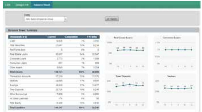
Balance Sheet by Entity Pre Built Dashboard