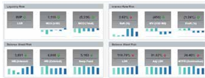
Key Risk Indicators Summary